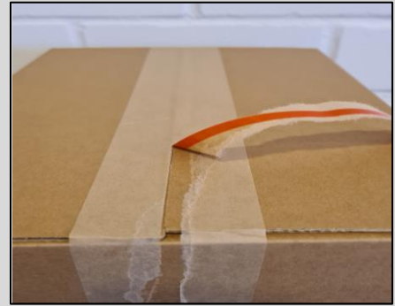
with tear strip

The U-closure is considered the standard and is the most commonly used. It can be supplemented with a user-friendly tear strip.